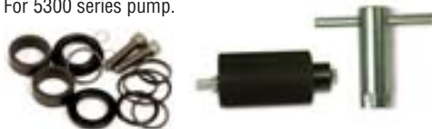
Piston Repair Kit